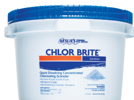
Chlorine Sanitize your swimming pool