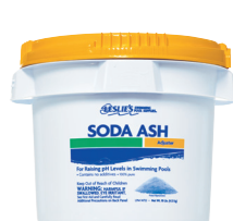
Balancers Correct your water balance