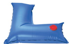
Closing accessories Simplify your pool closing